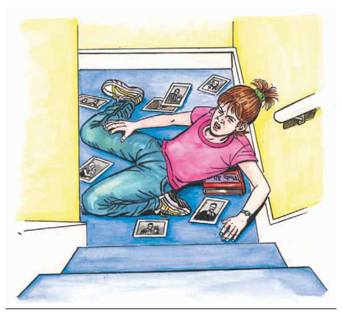
* A stroke is a sudden illness affecting parts of the brain, which can cause speech difficulties and loss of feeling in the body.

'Those who hurry fastest are the first to fall' was one of her Grampa's sayings, and it was as if she heard him saying it now, right out loud in her ear as she stumbled on the top step. Seconds later she landed with a crash at the foot of the stairs. Her head hurt, her bottom hurt and her legs throbbed painfully.